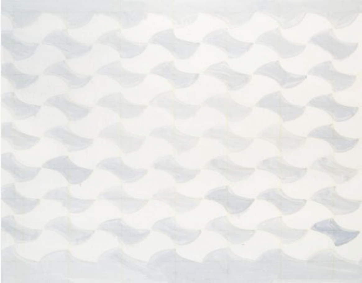
The Villager (2007) oil on canvas, 44 x 54"