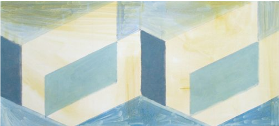
Albers (2007) oil on canvas, 12 x 24"