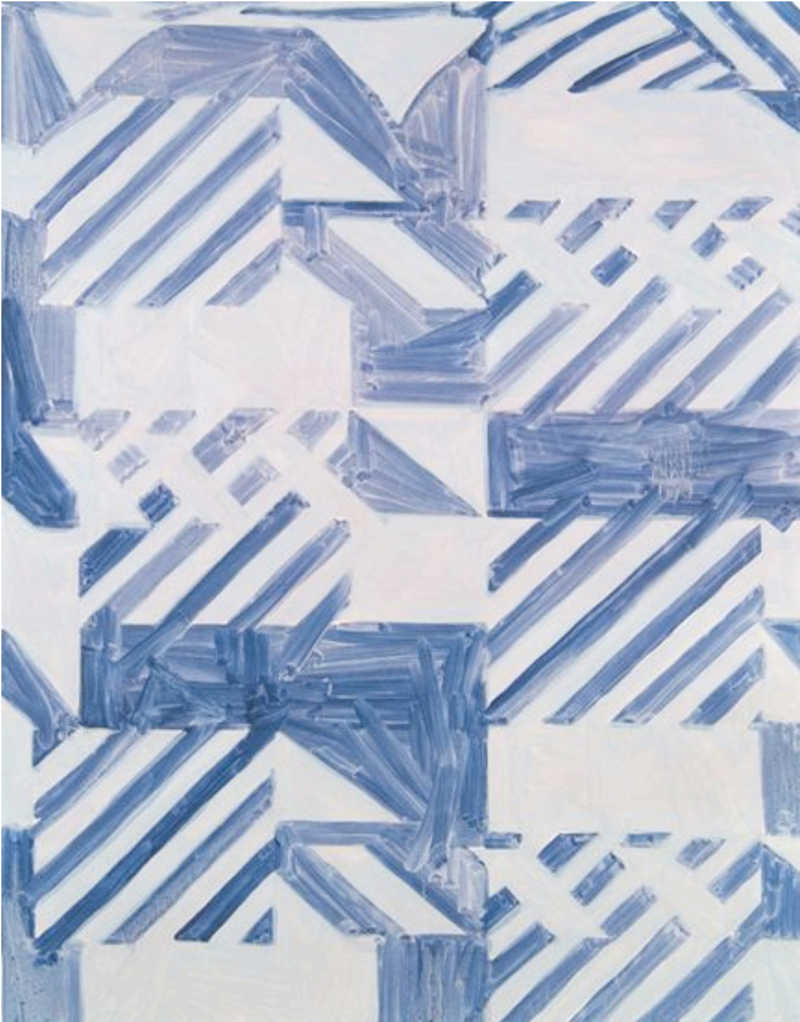
Untitled (2007) oil on canvas, 44 x 34"