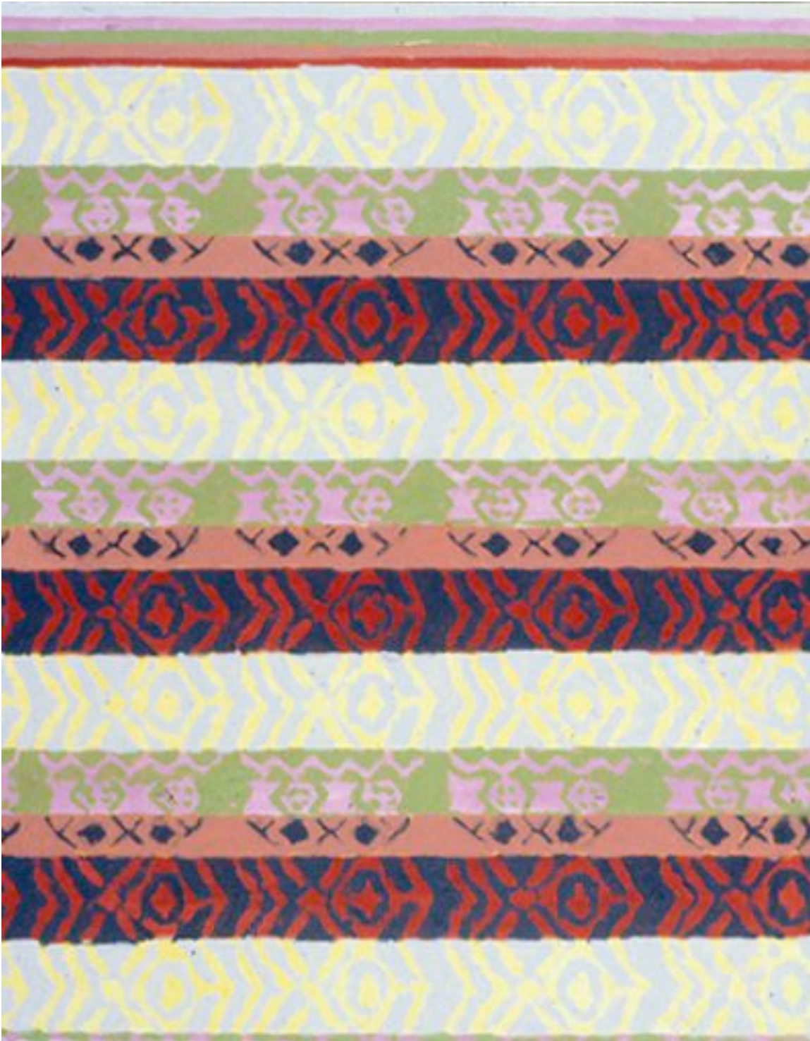
Small Sweater (2003) oil on canvas, 30 x 24"