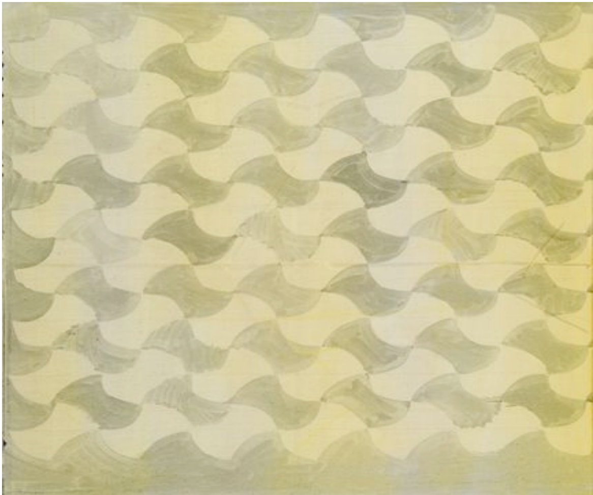
Walter S. Eleveld (2008) oil on canvas, 34 x 42"

For a while I've been making paintings based on found textiles: raw fabrics, printed towels, sweaters, shirts, skirts, rugs, quilts. Sometimes I want to represent the shape of the object—sleeves, pockets, folds—and other times I just lift the pattern. In all cases I try to replicate the object's design faithfully, while at the same time adapting it to the way I paint. There's an economic principle at work in textiles that I try to follow as a painter: to try to get the greatest effect with the simplest elements. The interesting thing for me about textile, and patterning in general, is the way in which decorative motifs are constantly, endlessly reappropriated, and change in unexpected ways with each particular use.