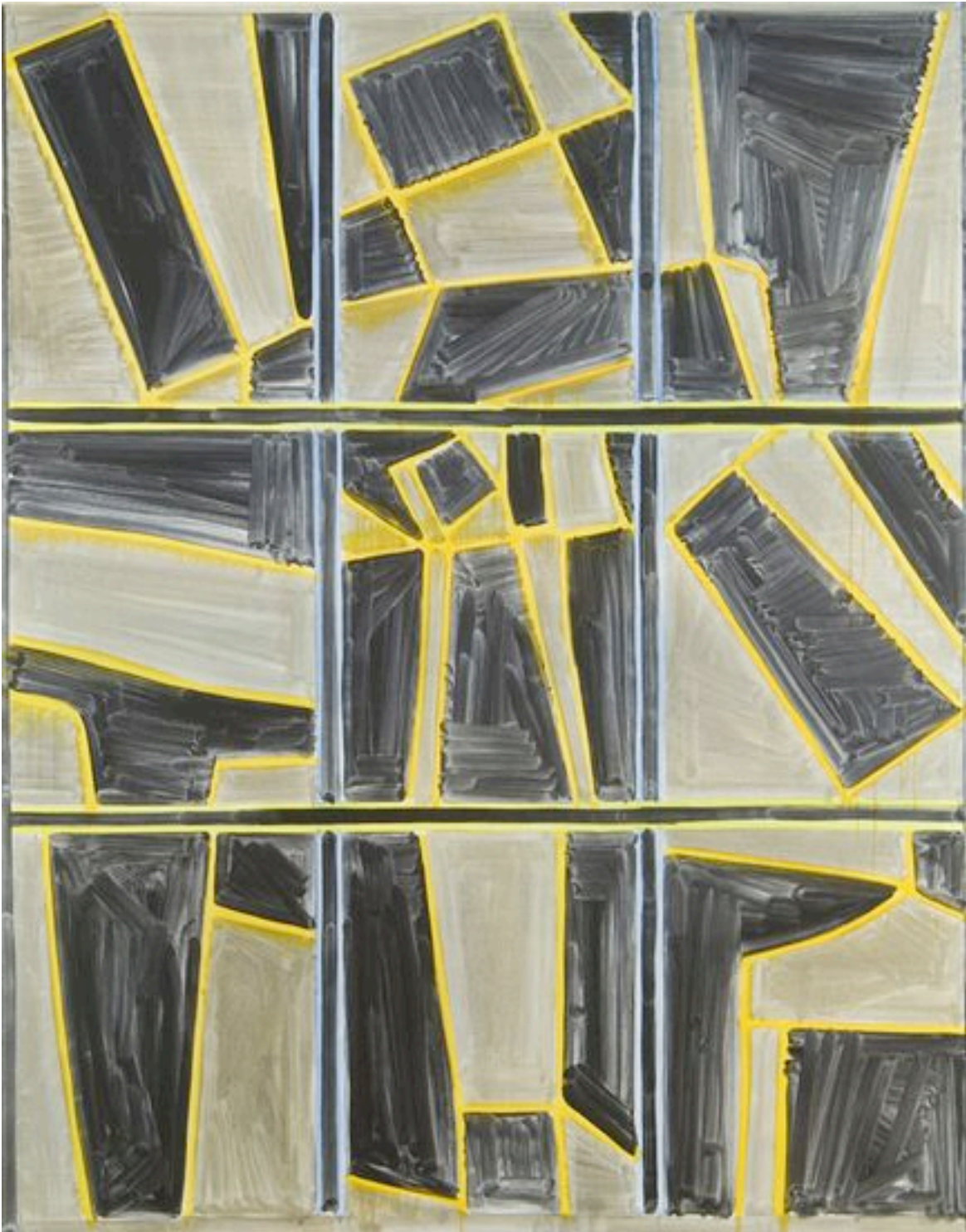
Free Copy (2008) oil on canvas, 62 x 50"