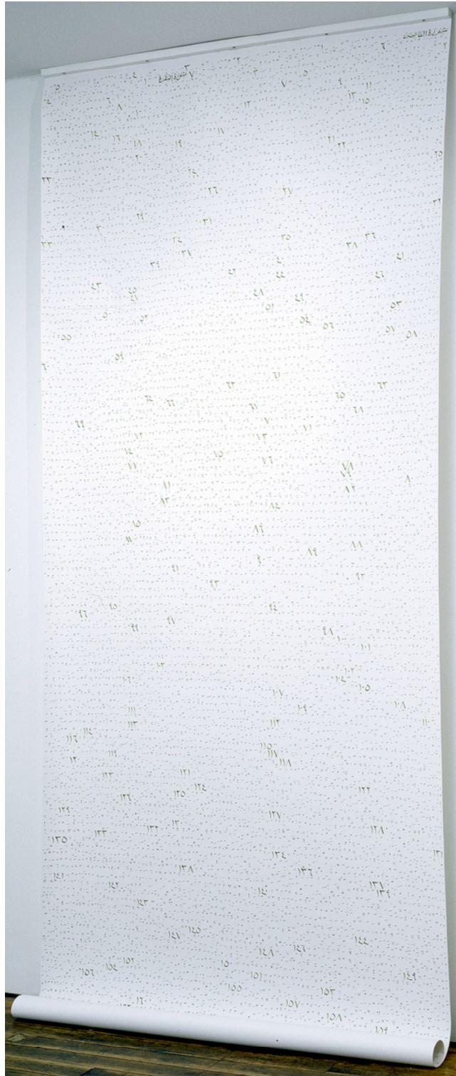
Gallery Installation M.Y. Art Prospects, New York, May/June 2006