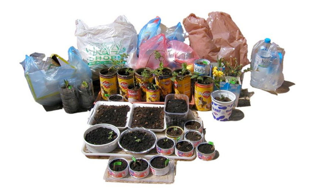
Flora growth stage one with garbage