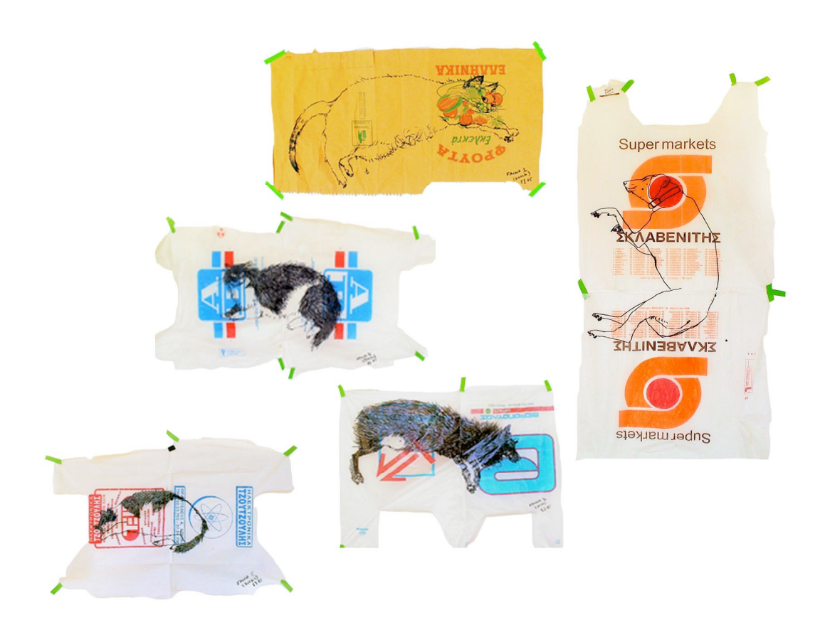
Fauna (clockwise: Gooch, Lotty, Olive, Boogie and Pseeps) ink on plastic shopping bags