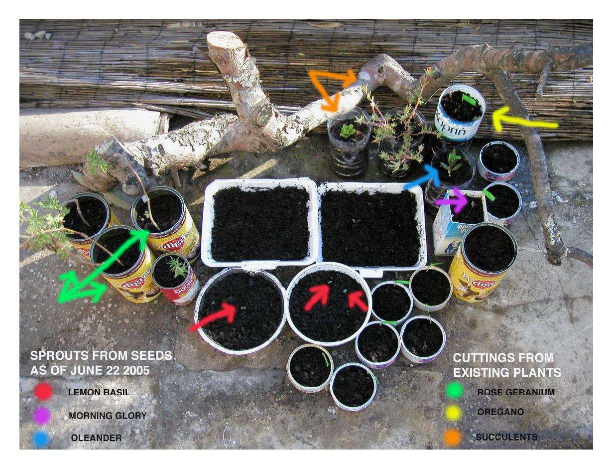
Flora growth stage one with legend sprouts and cuttings in tins