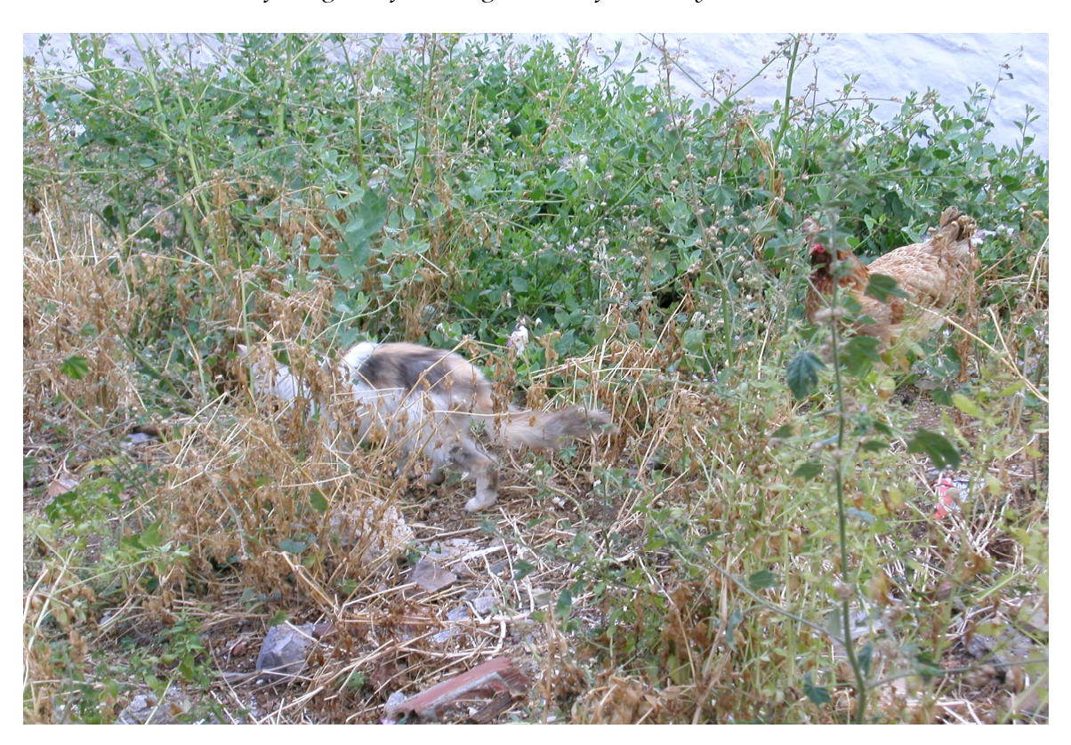
Rooster and cat at the makeshift landfill; Hydra, Greece video still

The title, "Flora and Fauna," refers to the two basic elements found in nature, and the use of garbage implies the environment. The materials used include a month's accumulation of "garbage" generated from my household, which includes the five animals depicted on the plastic supermarket bags. It is the empty tins of pet food that have been recycled into the basis for a garden, originating from a selection of seeds and cuttings taken from my own plants (mainly cooking herbs and other typical plants found on city balconies). The video footage is of the original landfill on Hydra.